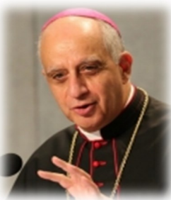
Bishop Rino Fisichella president of the Pontifical Council for Promoting New Evangelisation2013

Once we lose relationship with others, we cease to be persons and remain only individuals each one a monad (single unit) without any possibility of survival because a single individual is incapable of that love which generates life and solitude gains the upper hand.'